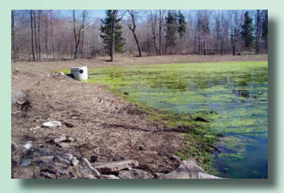
Algae from too much fertilizer interferes with pond functions and is unsightly

Have your soil tested to see how much fertilizer to use. Call Cornell Cooperative Extension at 424-9485