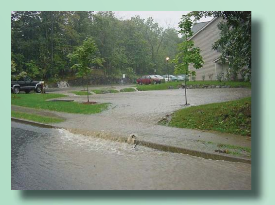
Stormwater runoff washes into the street on its way to the neighborhood pond