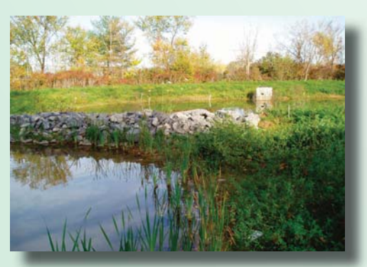
This is a well-constructed pond because it is deep and has vegetation close to shore

Breeding sites for mosquitoes that carry West Nile virus are often found on residential properties. Be sure to change water often in shallow wading pools, bird baths, and in other places where water collects, and clean clogged rain gutters.