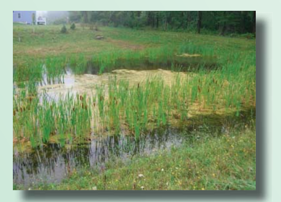
This is a poorly-constructed pond because it is too shallow to function properly