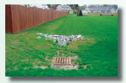
A grassed swale between properties

Grassed swales must be maintained to function properly.