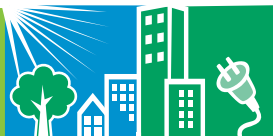
Climate Showcase Communities Local Climate and Energy Program

In 2009, the United States Environmental Protection Agency (EPA) launched a competitive grant program to assist local and tribal governments in establishing and implementing climate change initiatives.